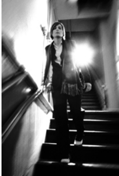
Jacket by THE BREED, shirt by TOWNCRAFT, pants by JEAN-PAUL KNOTT. Bow tie and scarf by CHARLES TYRWHITT. Shoes by CAMPER.